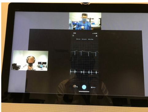
Figure 2: Cisco DX80 showing visual tracing of the Eko ECG application on a shared screen in the CaViAs project.

Testing audio quality showed that the Thinklabs One device was comparable to the Eko Duo, however the set up and settings on the device itself were technically challenging. The Littman sound quality, even when paired with the TeleSensi platform that is intended to enhance the experience, was suboptimal and introduced static and suboptimal lung sounds. The Eko Duo was the easiest digital stethoscope to set up and connect to other devices, with no settings on the device itself that would require manipulation, and minimal interference when moving the device over the skin. When comparing the Eko ECG app to TeleSensi and Zoom, the steps to activate the Eko ECG app were significantly less. The Eko ECG app is the only platform that has visual representation of both the sound and electrical cardiac waves. The TeleSensi platform provides audio visualizations of the sound waves (phonocardiography), however, in tests, the audio quality was suboptimal and the steps to connect the digital stethoscope to the platform were cumbersome, necessitating session codes,